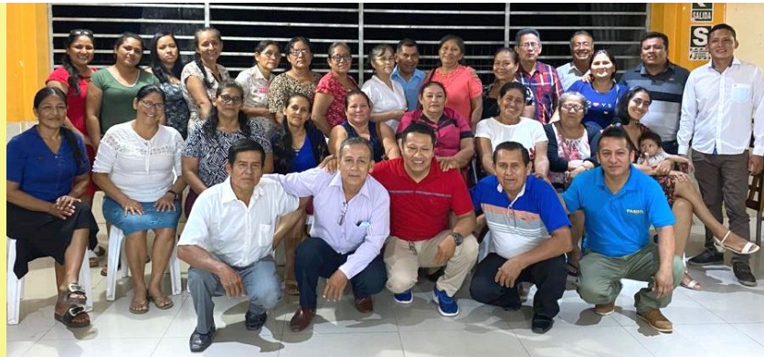
Pastors and leaders of Luz Divina church